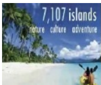
More Than The Usual